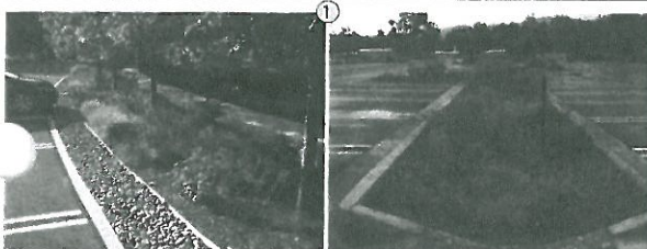
Growing Greener Grant Project