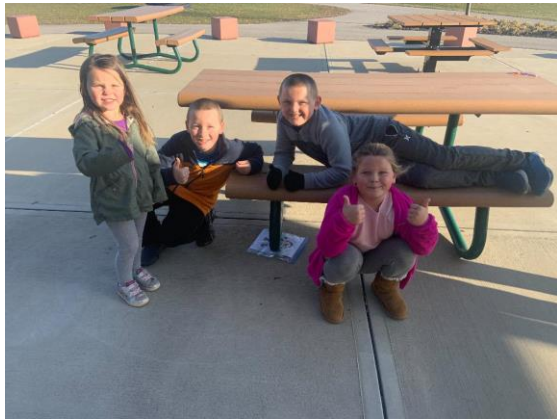
Candy Cane Hunt at the Parks