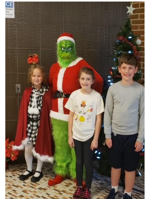
Kids Grinch Paint Class