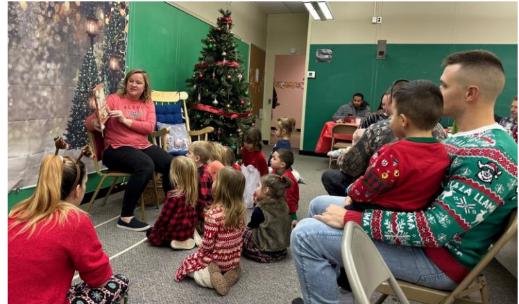
Childcare Mingle and Jingle