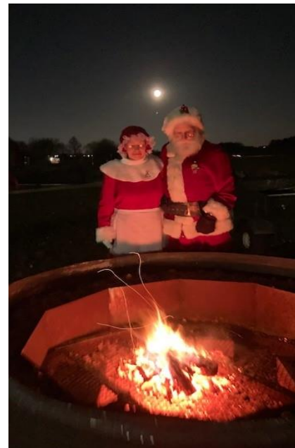
Santa Meet & Greet